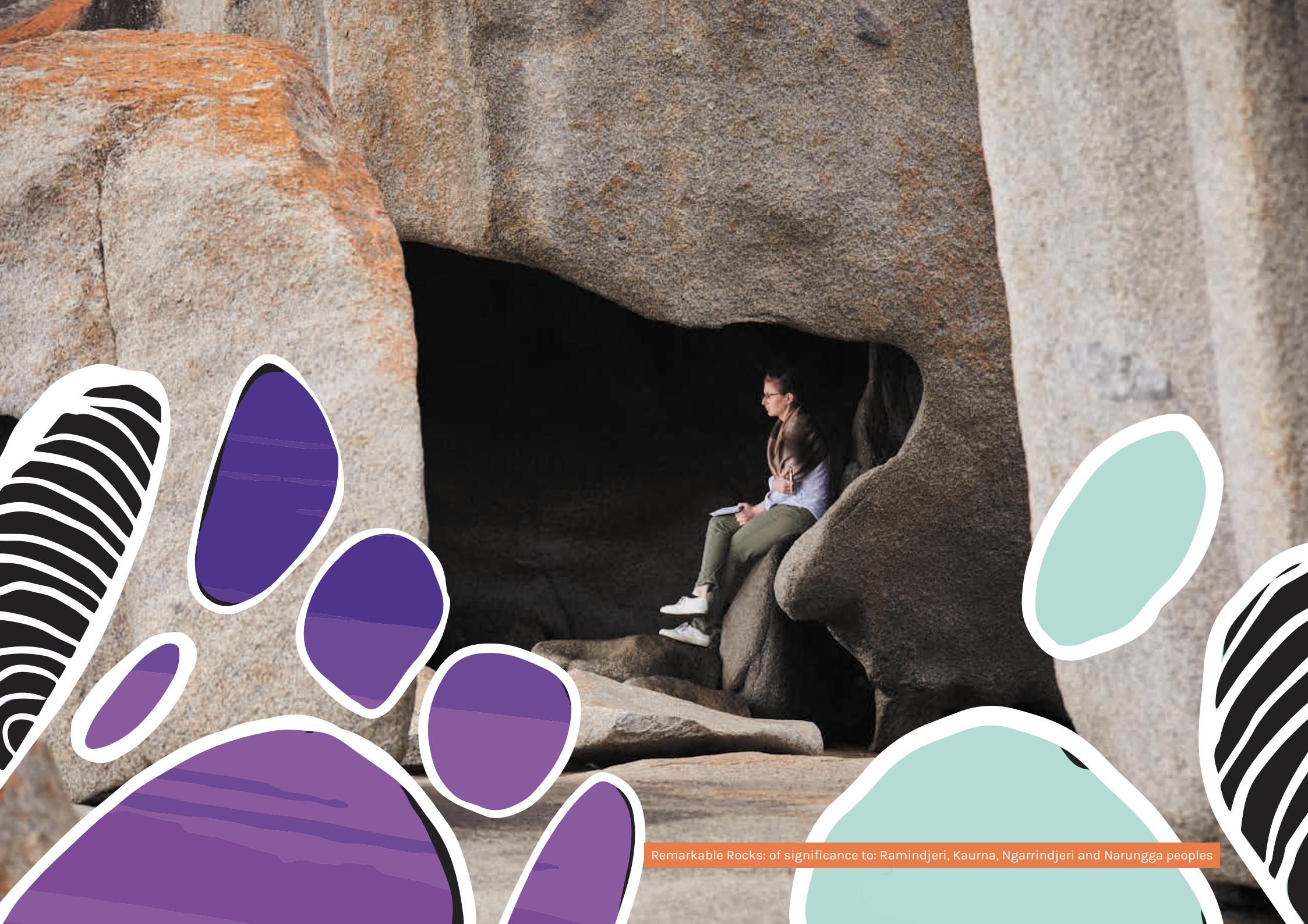
Remarkable Rocks: of significance to: Ramindjeri, Kaurna, Ngarrindjeri and Narungga peoples