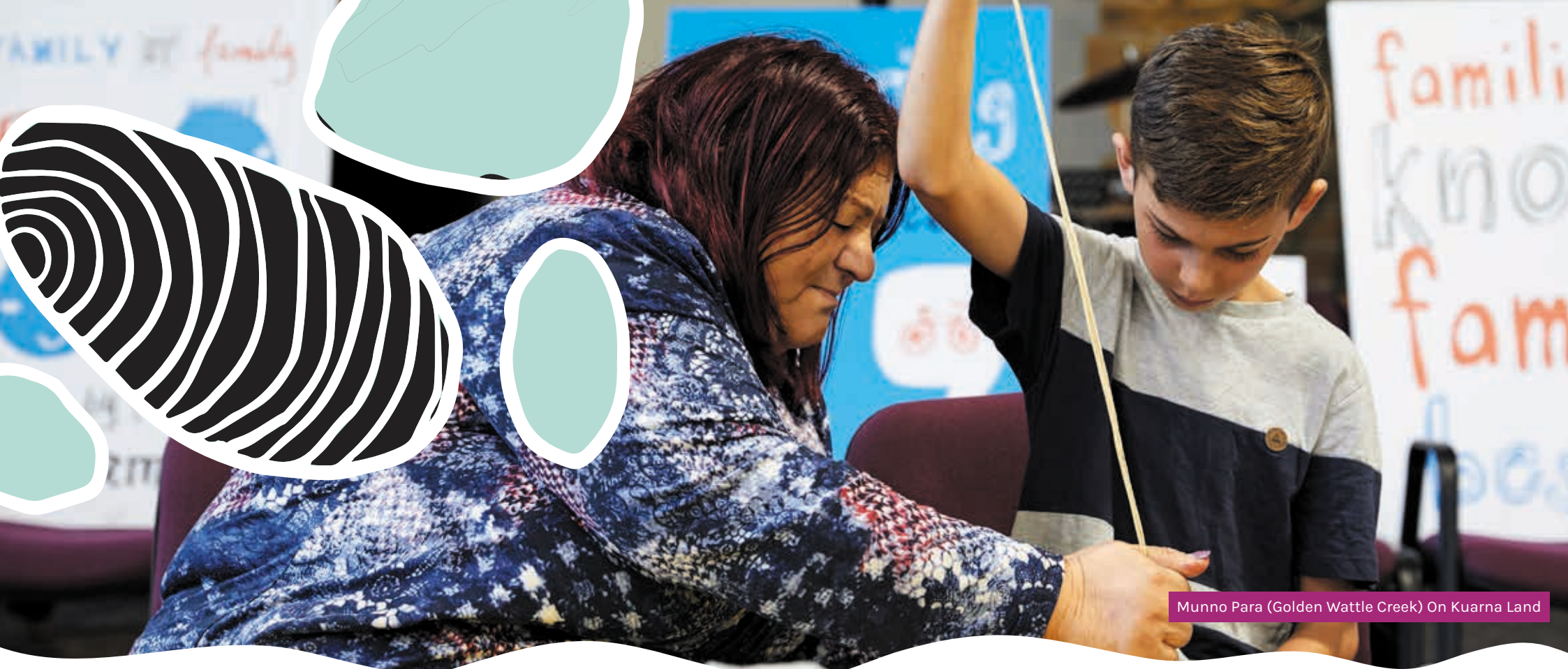
Munno Para (Golden Wattle Creek) On Kuarna Land