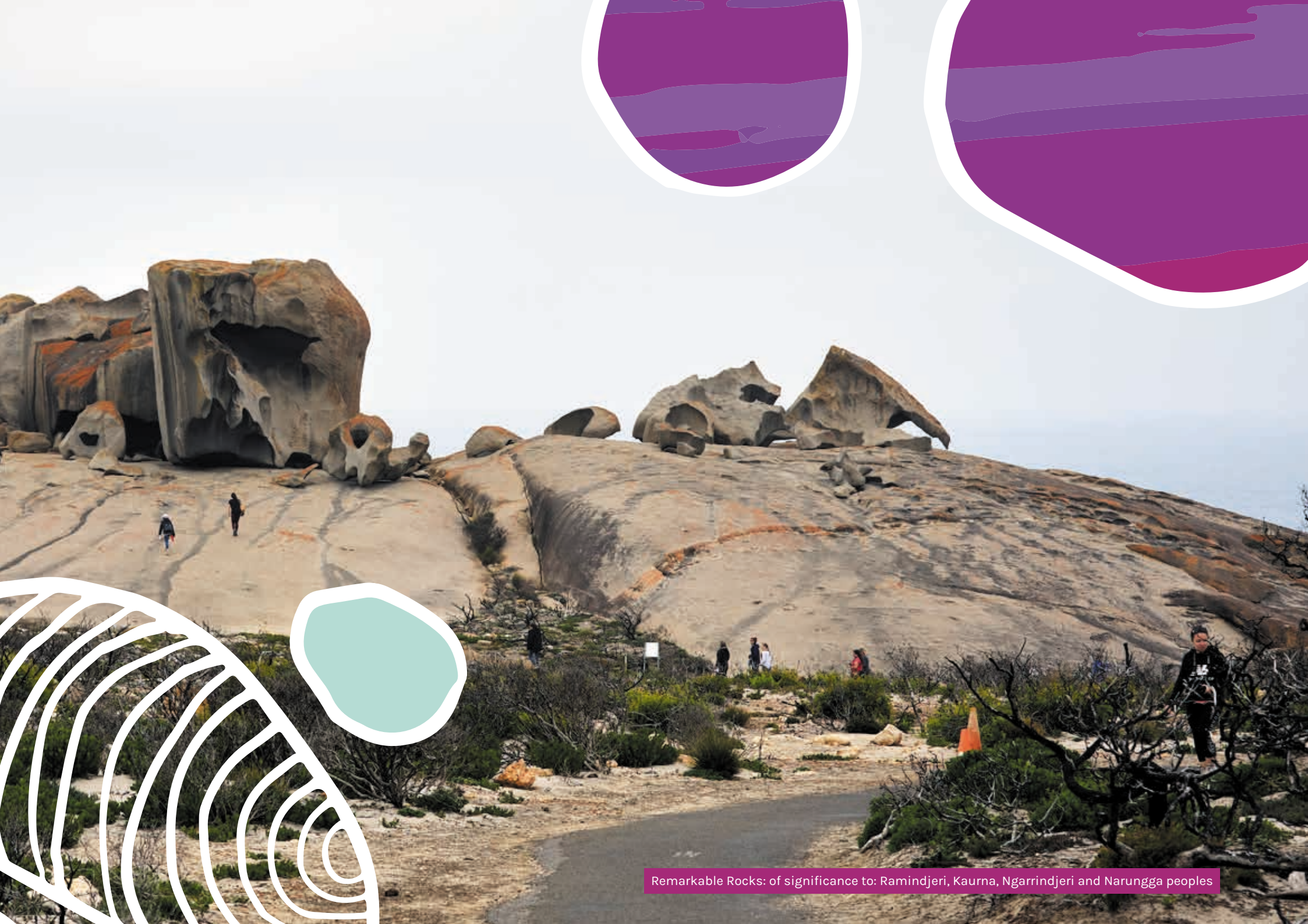
Remarkable Rocks: of significance to: Ramindjeri, Kaurna, Ngarrindjeri and Narungga peoples